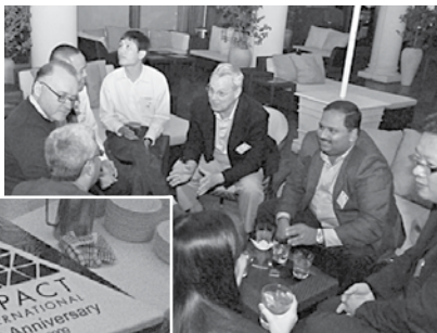
△ Informal cultural exchange in Macau