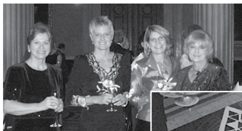
△ Gala Evening

Celebrating International's 20th Anniversary ▽